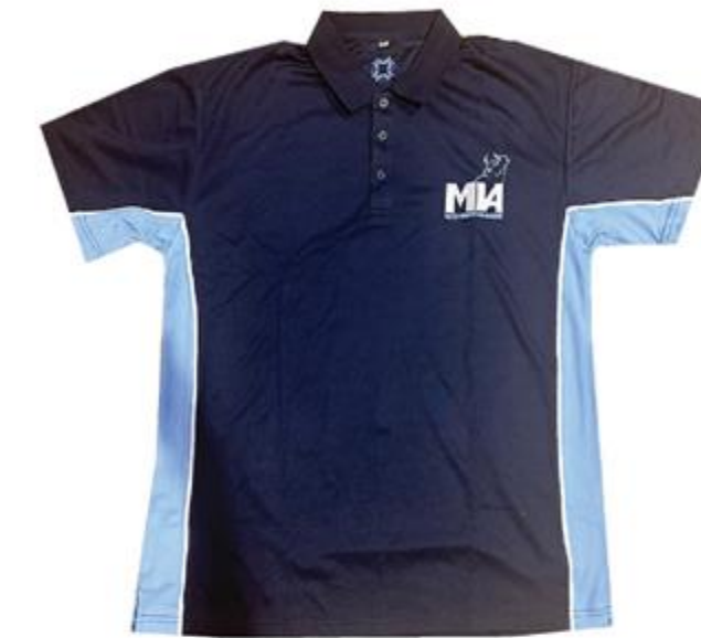
Two Tone Dri-fit Polo Navy/Blue Starting at $28.93