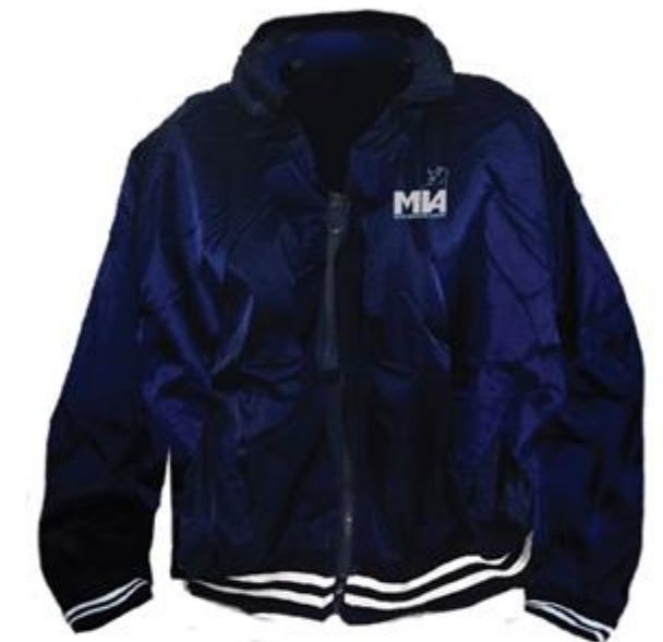
Reversible Navy Jacket Starting at $42.93