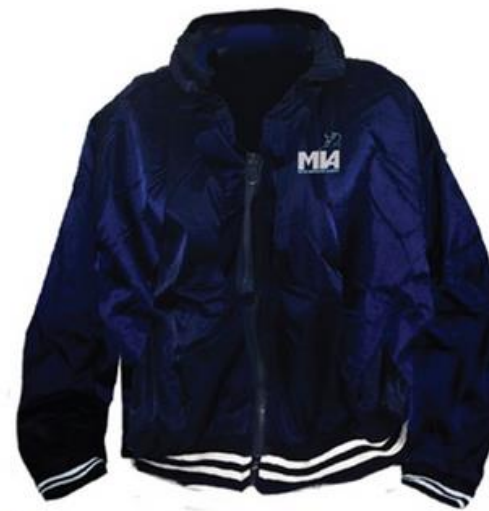
Reversible Navy Jacket Starting at $42.93