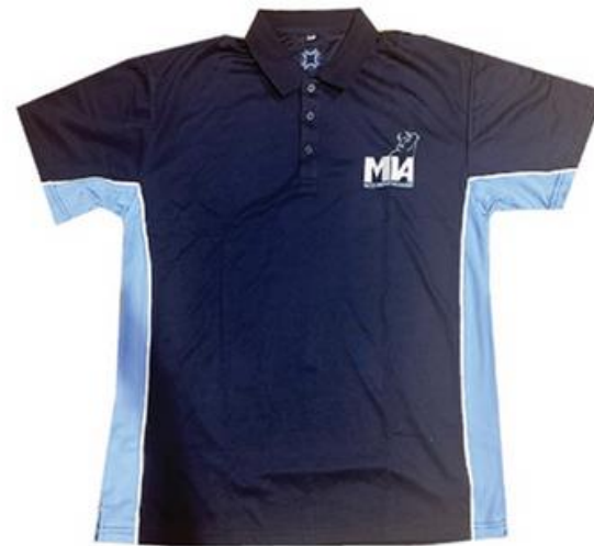
Two Tone Dri-fit Polo Navy/Blue Starting at $28.93