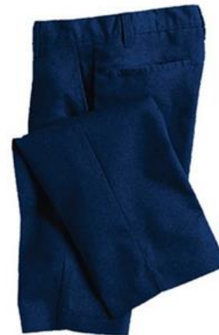
Navy Pants Starting at $19.94